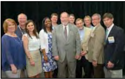
Left: A photo of many of the Shreveport lawyers in attendance at the Installation Dinner during the 2014 Annual Meeting.