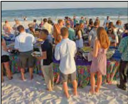
Left bottom: The Beach Bash was well attended by families and friends during the 2014 Annual Meeting.