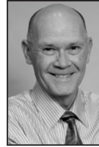
Judge Woody Nesbitt (Ret.)