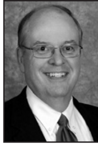
Justice E. Joseph Bleich (Ret.)