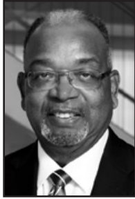
Judge Freddie Pitcher, Jr. (Ret.)