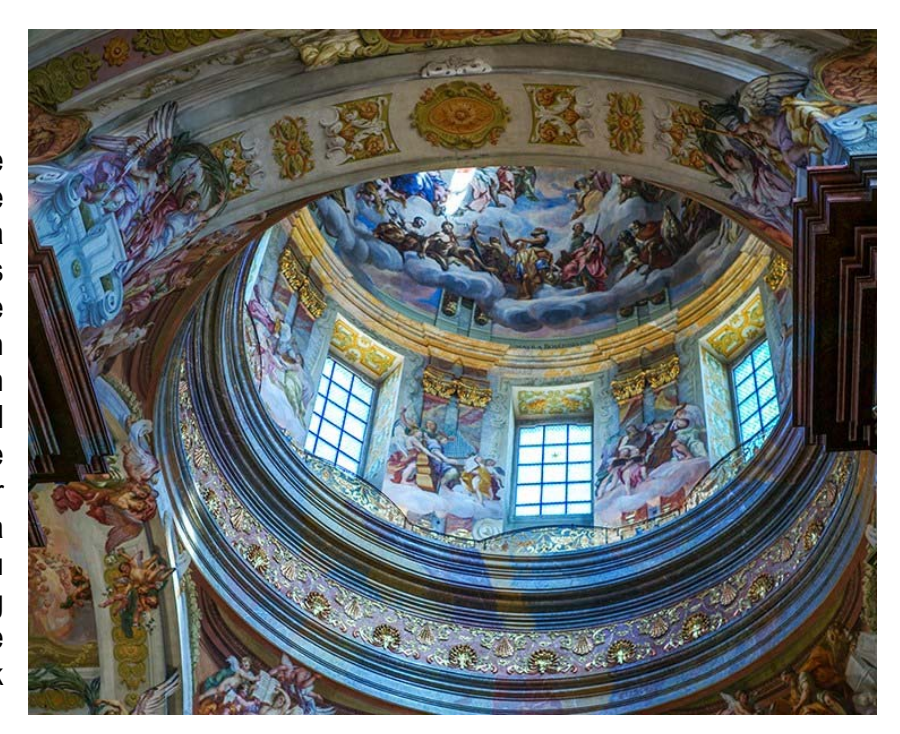
Day 4 LINZ

After reaching the Wachau Valley in the morning, you'll have a choice of three excursions in Dürnstein. Partake in a walking tour along cobblestone streets to the luminous blue facade of the Baroque Stiftskirche, its famed church tower, before enjoying a wine tasting in a local cellar. Alternatively, visit a local boutique, where you'll be treated to the region's finest apricot products. After your morning excursions, you have a choice to cruise through the Wachau Valley to Melk or join a bike tour along the Danube. Upon reaching Melk, take a tour of the UNESCO-designated Melk Abbey. (B, L, D)