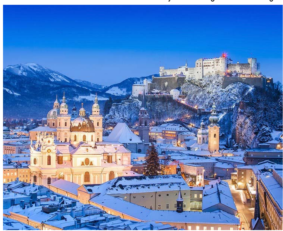
located just over the Czech-Austrian border. (B, L, D)

Linz is known for being the city of Christmas crèches and its ever-popular Linzer Torte. While here, you have a choice of three excursions. The first is a full-day visit to magnificent Salzburg dressed in her holiday best. Enjoy a